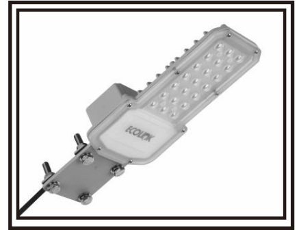
LED STREET LIGHT